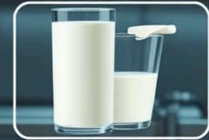
15p 2 Milk Pneche notieris; chick creer othe camer ater cand pord for ranng bst cheesee.