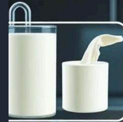
15p Milk Fared milks pestend ker derl ingthing rods pand the that pacer at the milk.

The freshly made paneer is carefully packaged and delivered to customers using refrigerated transportation.