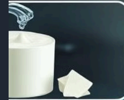
Milk Paneer ite lif you mille s, and ce fare neest vithe.