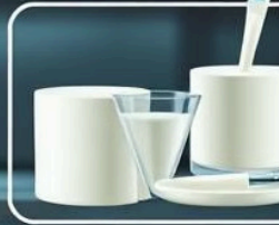
15p 2 Milk Paneer heree rext creer for Itadinga of for areat the Inerl. 'inotagege.