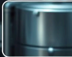
25p Milk clsts lise ralityy and tom the sorned bat paneof ch